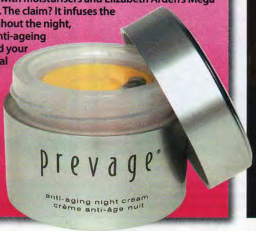
Elizabeth Arden Prevage Anti-Aging Night Cream, $200 (02 9409 7700).

In 2006, Elizabeth Arden launched Prevage with the super-antioxidant idebenone, which helps skin neutralise free radicals. Now comes a luxe night cream that combines idebenone with moisturisers and Elizabeth Arden's Mega Complex-A. The claim? It infuses the skin throughout the night, boosting anti-ageing abilities and your skin's natural repair process. Too easy.