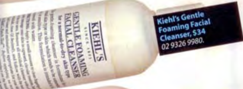
Kiehl's Gentle Foaming Facial Cleanser, $34 02 9326 9980.