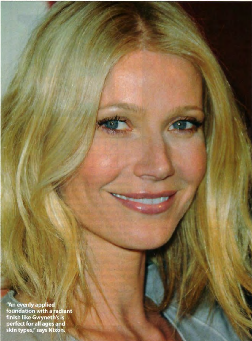
"An evenly applied foundation with a radiant finish like Gwyneth's is perfect for all ages and skin types," says Nixon.