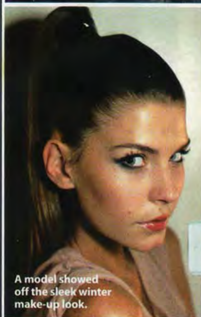
A model showed off the sleek winter make-up look.

From the night's goodie bag: Estée Lauder's Magnascope mascara and Pure White Linen Light Breeze eau de parfum. Nice score!