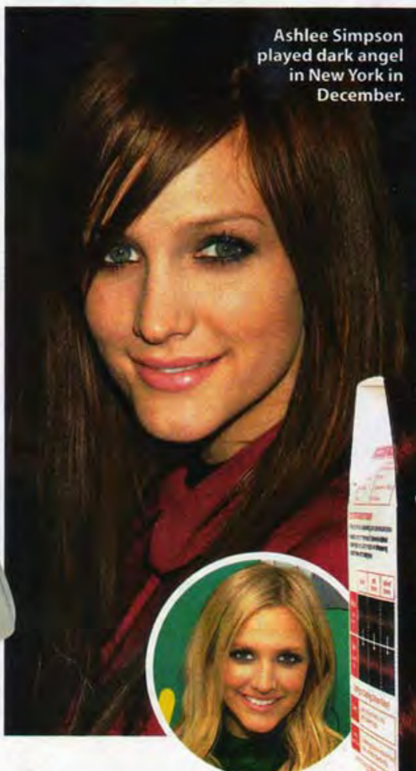
Ashlee Simpson played dark angel in New York in December.