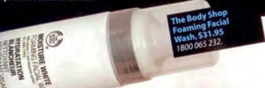
The Body Shop Foaming Facial Wash, $31.95 1800 065 232.

No matter what you're reading to get your beauty fix, most sources concur that women are reaching out for more streamlined, time-efficient beauty regimens. We want more from our skincare, with less fuss but lots of luxe. The three-step process of cleanse, tone and moisturise that was drummed into our mothers and grandmothers is now less rigid, with toners being the most common step left out of new product lines. Cleansers are still a must-have and can be as basic as you like—a good, balanced pH is all you need, especially if you have sensitive skin.