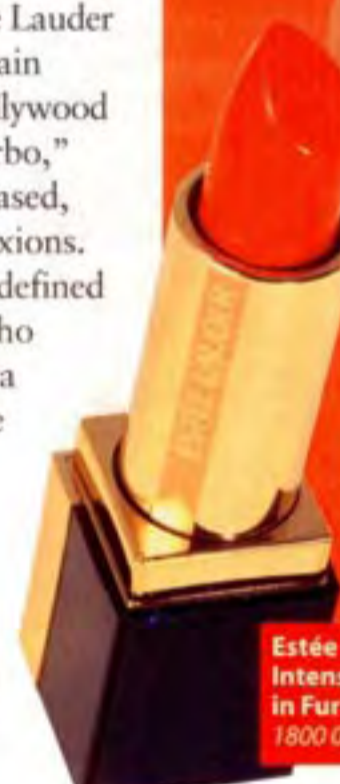
Estée Lauder Electric Intense Lip Creme in Fury, $44 1800 061 326.