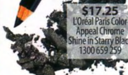
$17.25 L'Oréal Paris Color Appeal Chrome Shine in Starry Black 1300 659 259