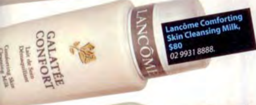
Lancôme Comforting Skin Cleansing Milk, $80 02 9931 8888.