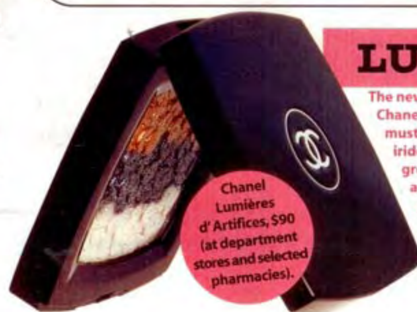
Chanel Lumière d'Artifices, $90 (at department stores and selected pharmacies).

The new limited-edition compact from Chanel (on sale on Feb. 25) is so divine, it must be heaven-sent. Three shimmery, iridescent highlights—golden, steel grey and luminous white—for eyes and cheeks are presented in a sequin pattern inspired by its use in haute couture.