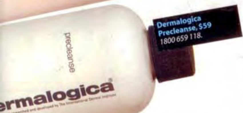
Dermalogica Pre-cleanse, $59 1800 659 118.