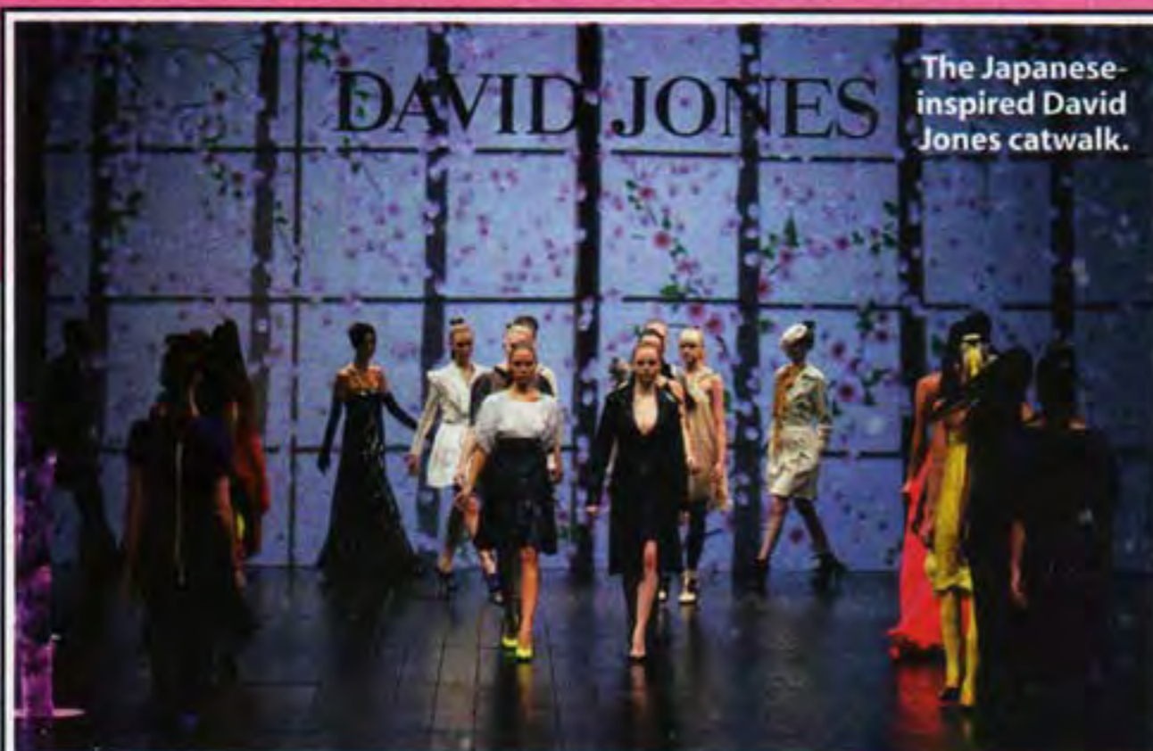
DAVID JONES The Japanese-inspired David Jones catwalk.