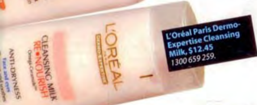
L'Oréal Paris Dermo-Expertise Cleansing Milk, $12.45 1300 659 259.