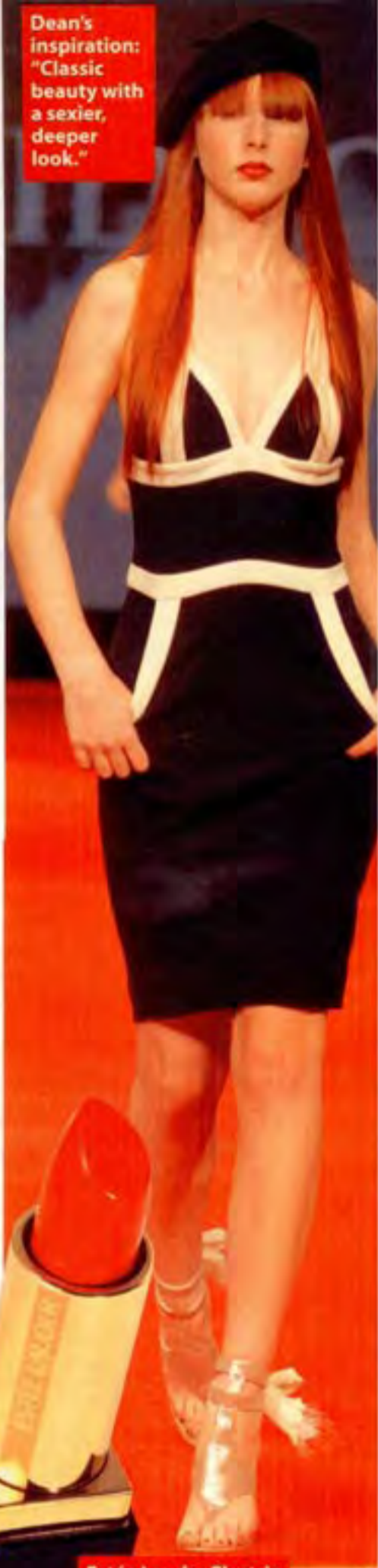
Dean's inspiration: "Classic beauty with a sexier, deeper look."