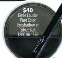
$40 Estée Lauder Pure Color Eyeshadow in Silver Ball 1800 061 326