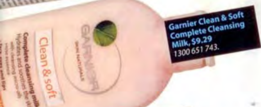
Garnier Clean & Soft Complete Cleansing Milk, $9.29 1300 651 743.