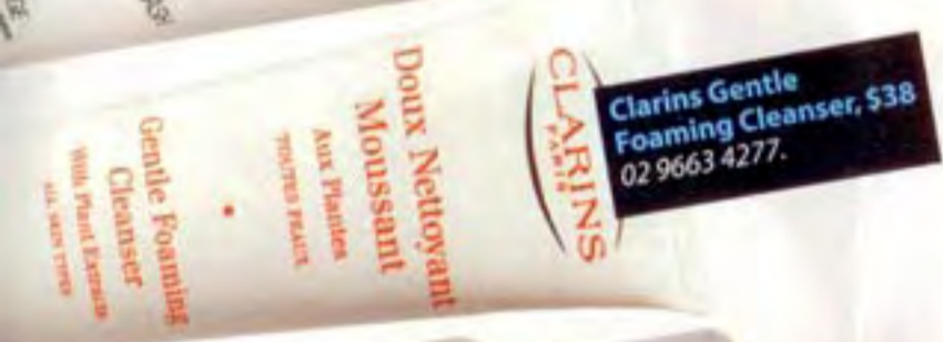
Clarins Gentle Foaming Cleanser, $38 02 9663 4277.