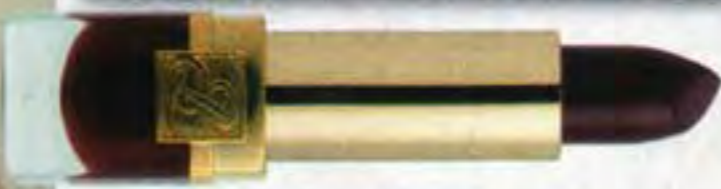
Estée Lauder Pure Colour Lipstick in Black Wine, $44 (1800 061 326).