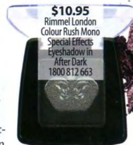
$10.95 Rimmel London Colour Rush Mono Special Effects Eyeshadow in After Dark 1800 812 663